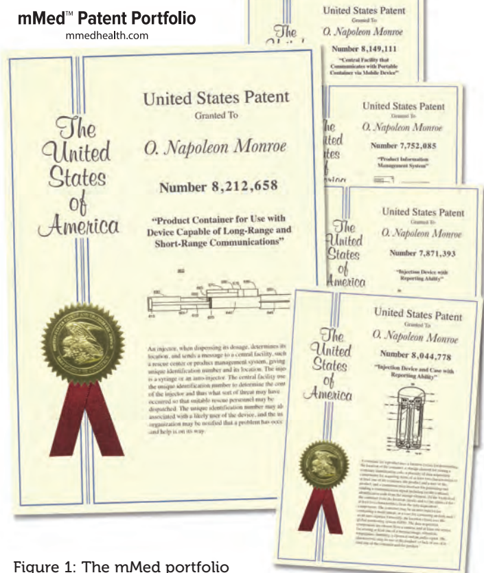
Figure 1: The mMed portfolio comprises five granted US

New Directions entered the medication management field with patent filings early in the era of connected medication delivery product development. New Directions was able to secure claims that are of significant value to companies engaged in activities related to connected drug delivery.