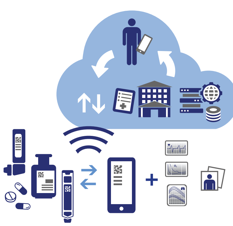
Figure 2: The covid-19 pandemic has been a key driver of connectivity and telehealth's acceptance in mainstream healthcare. However, now that it is here, it is time to realise the full potential that it offers.

required to combat the ensuing pandemic. It is these restrictions that finally drove acceptance and adoption of telemedicine into the mainstream (Figure 2).